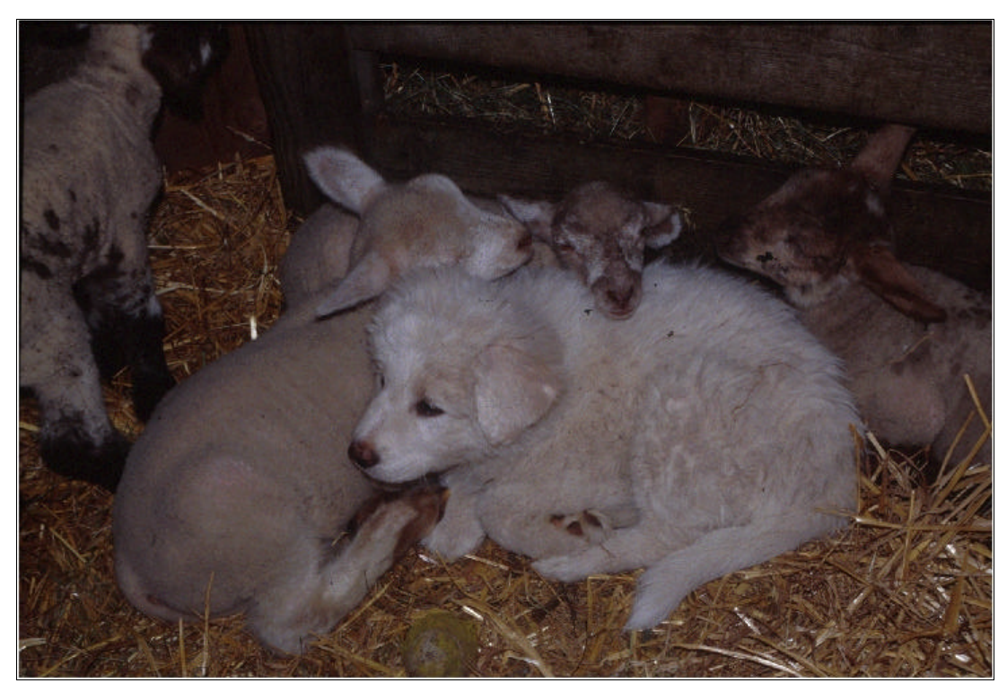
Figure 2: A two months old Great Pyrenees with lambs

As adults, guard dogs have a tendency to keep the