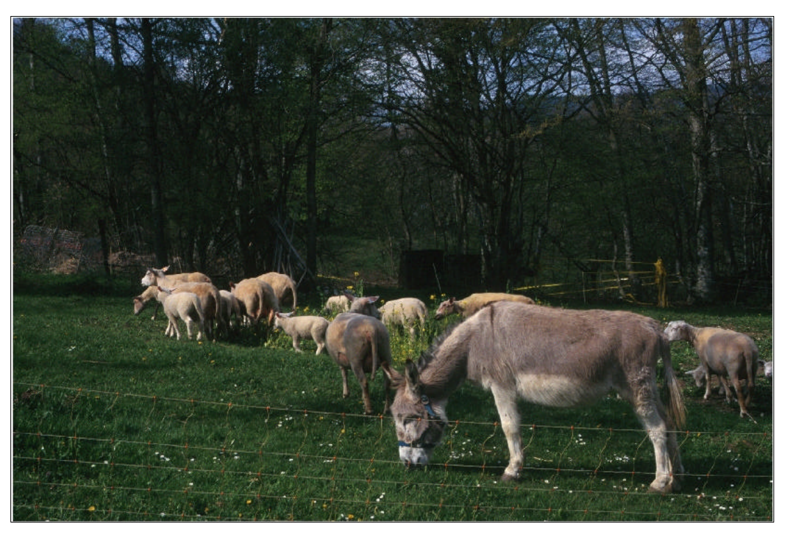
Figure 4: Donkey in a flock of sheep

(1988), Raveneau & Daveze (1994) and Bourne (1994) is the donkey. At present, 78 races are recognised by the FAO (Food and Agriculture Organisation). The donkey is believed to have been domesticated more than 5000 years ago from a wild ass Equus asinus nubicus, which is still found today in the Sudan (Raveneau & Daveze 1994). Depending on the race and individual, weights can vary from 80 kg (dwarf races) to 480 kg (Baudet du Poitou) (Raveneau & Daveze 1994). In numerous engravings and pastoral stories, the donkey is found in the middle of the sheep (Pitt 1988). The donkey was, and is still, used in many mountain regions for the transport and provisioning of shepherds in summer (Pitt 1988). The donkey can today be an excellent guard (Fig. 4), able to give warning by loud and unusual braying at any problem or of an inopportune visit. Its aversion for canids seems to be used in many European countries. It is used to guard herds of sheep, goats and cows. Its presence is particularly effective against stray dogs and foxes (Pitt 1988, Raveneau & Daveze 1994). Female donkeys are also good guards, on condition that they are not pregnant, since they are at risk of aborting (Raveneau & Daveze 1994).