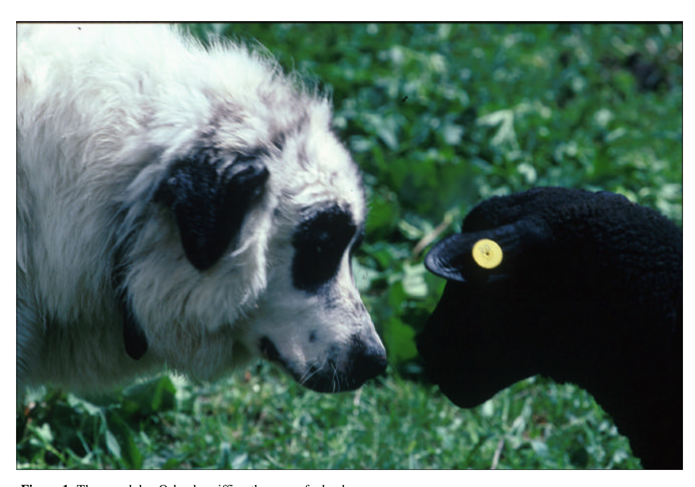
Figure 1: The guard dog Orlando sniffing the nose of a lamb