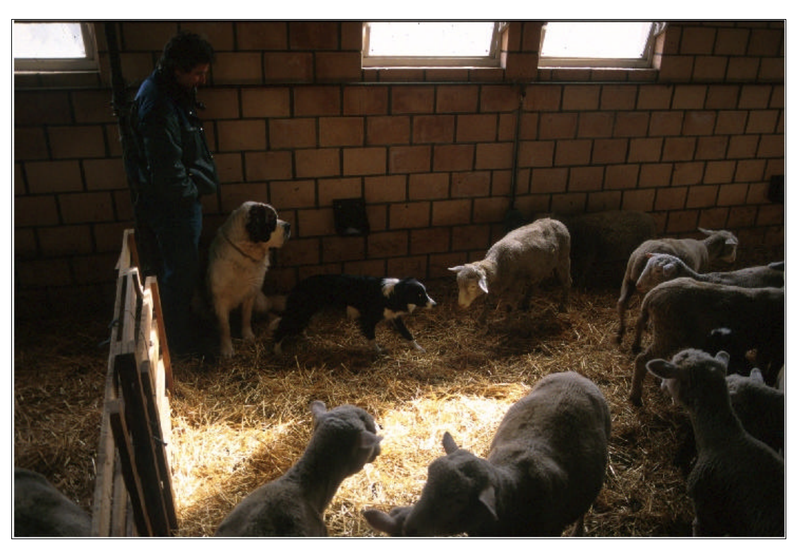
Figure 3: Border collie stalking a sheep while the St-Bernard remains neutral

A guard dog which is not loyal does not necessarily have predation behaviour, but it tends to play with the sheep as it would play with other dogs (Coppinger et al. 1987). If the sheep does not react or stops in its flight, the dog seeks another playmate or else the dog's play behaviour turns into an investi-